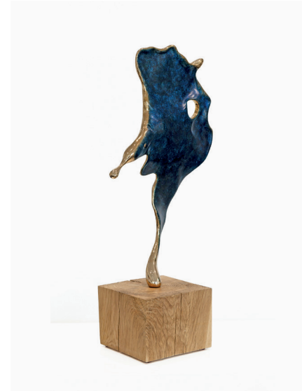
TOP LEFT CJ Crooks - Splash