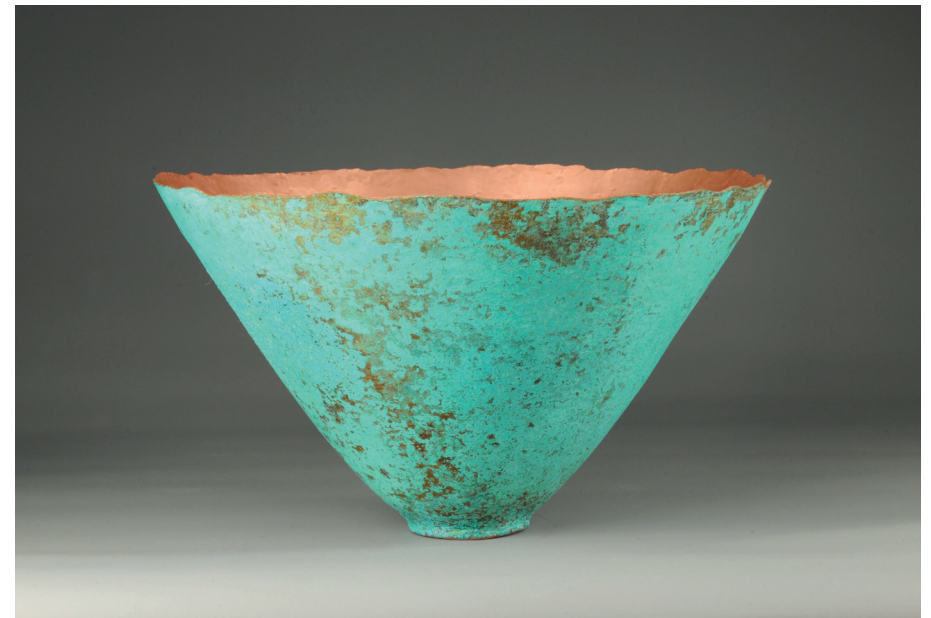
TOP LEFT CJ Crooks - Spray