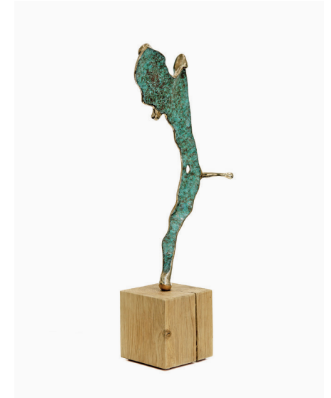
ABOVE Simon Hawkes - Copper Vessel 2