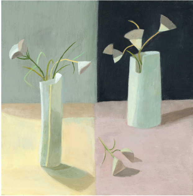
TOP Flowers from Potager Garden