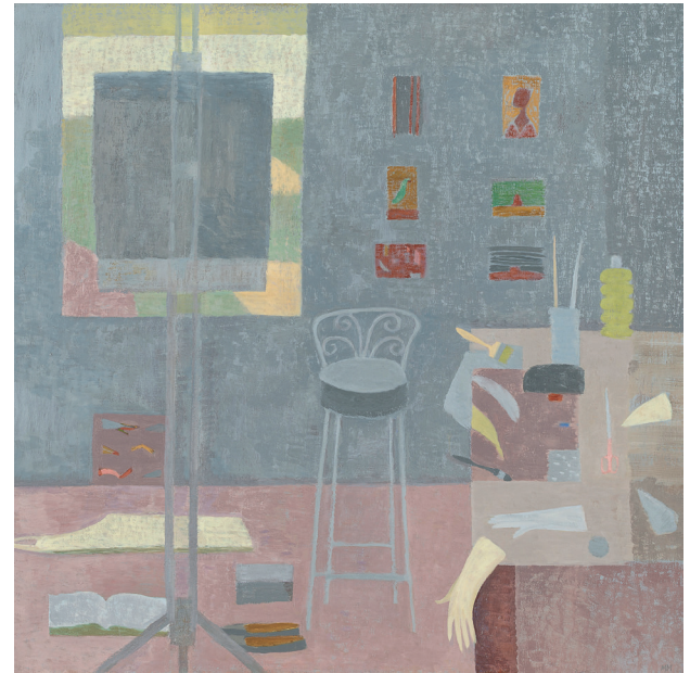
TOP Grey Studio