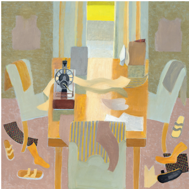
ABOVE Sunny Sewing Room