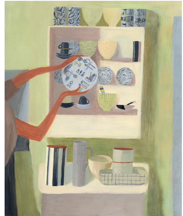
TOP Cabinet IV