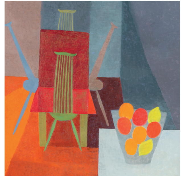
TOP Warm Room