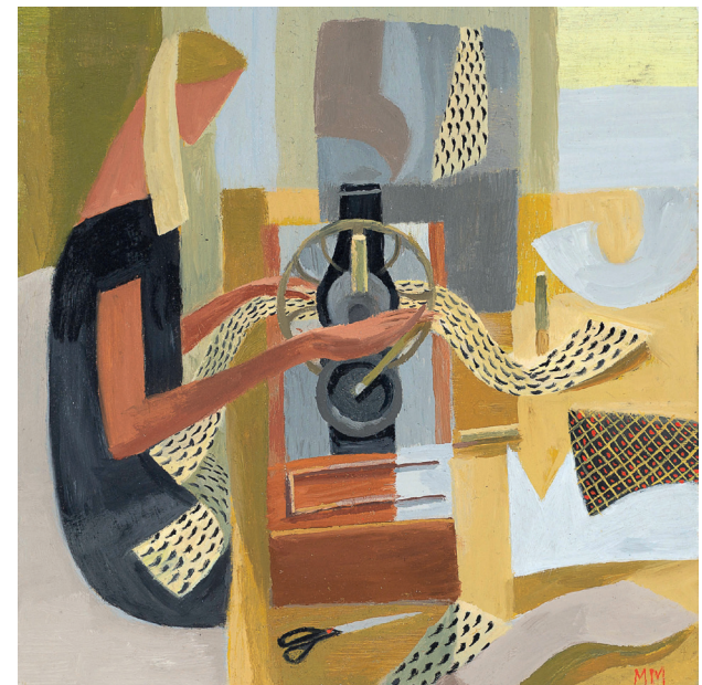
ABOVE Sewing Study III