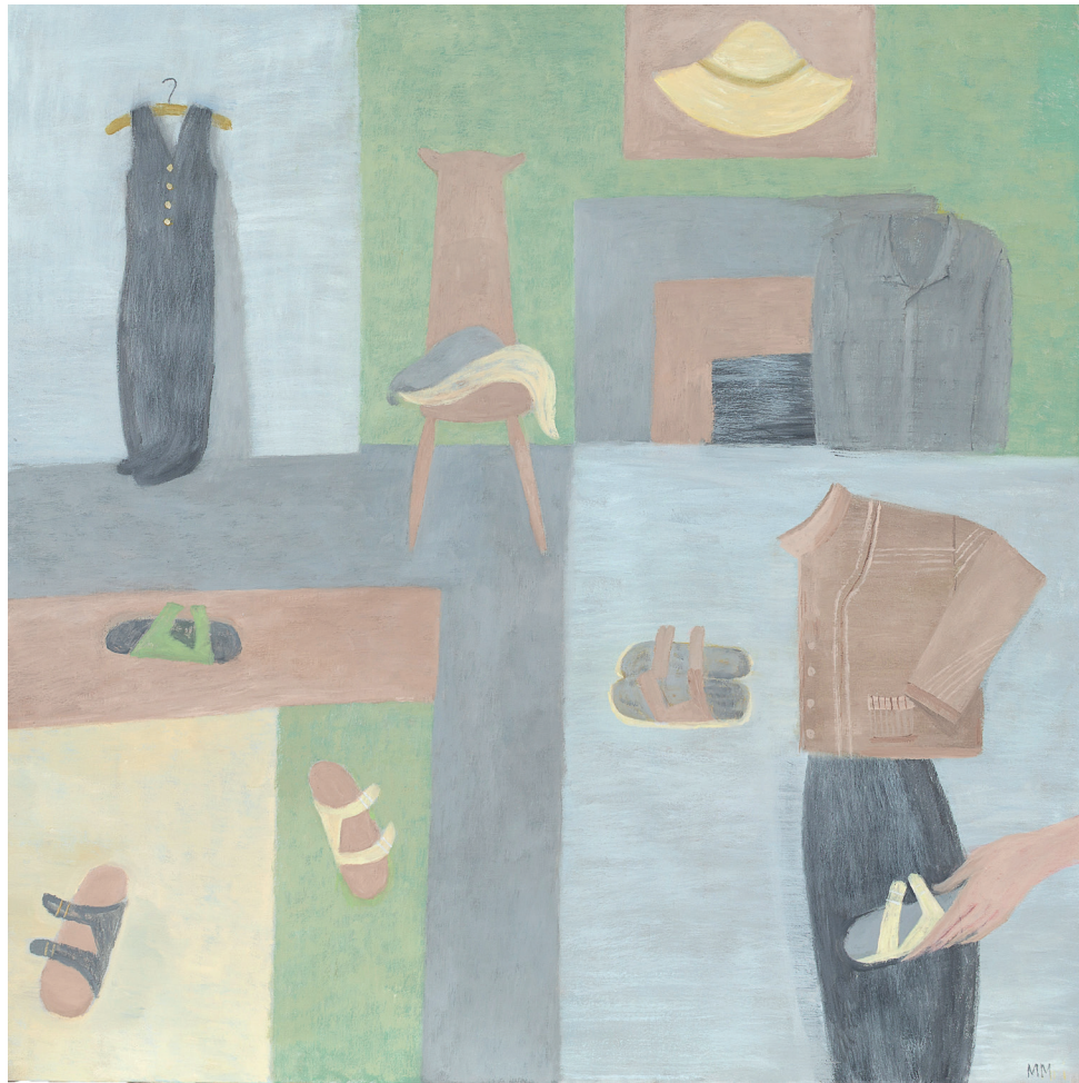
ABOVE Bedroom III