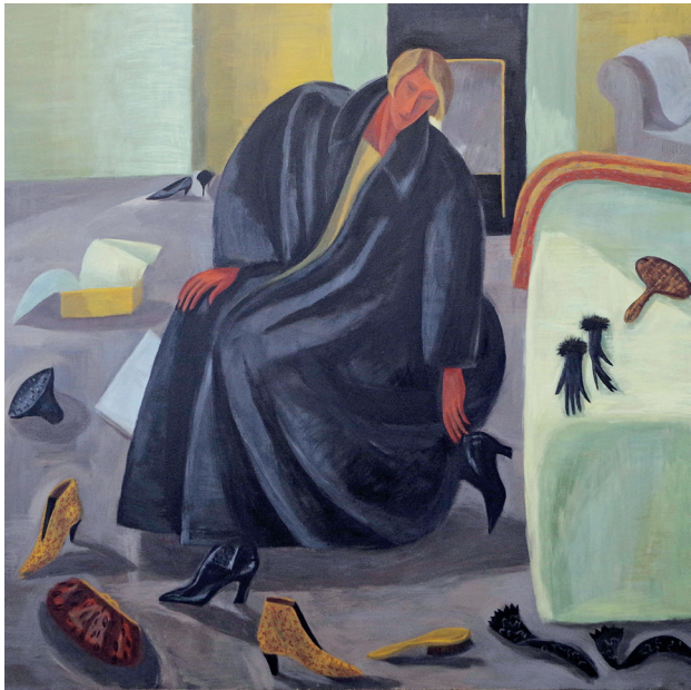
TOP Smart Black Boots