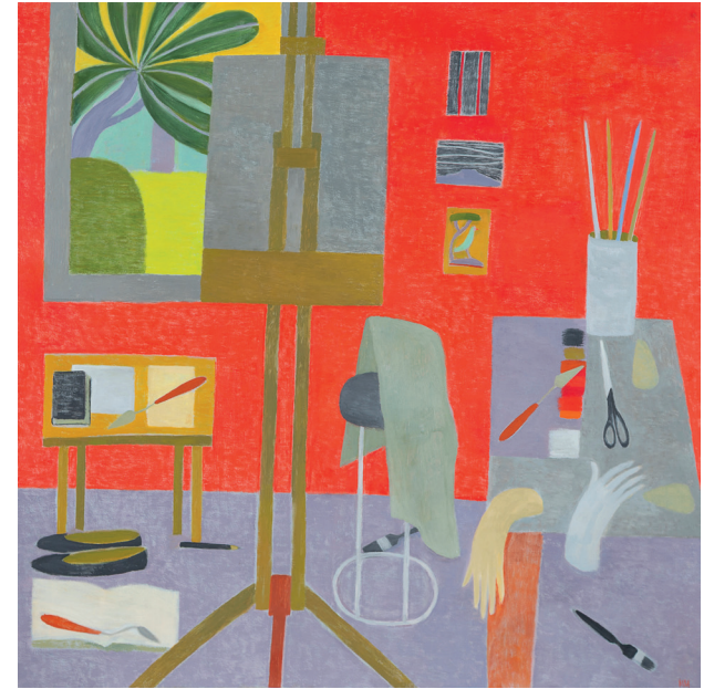
TOP Red Studio II