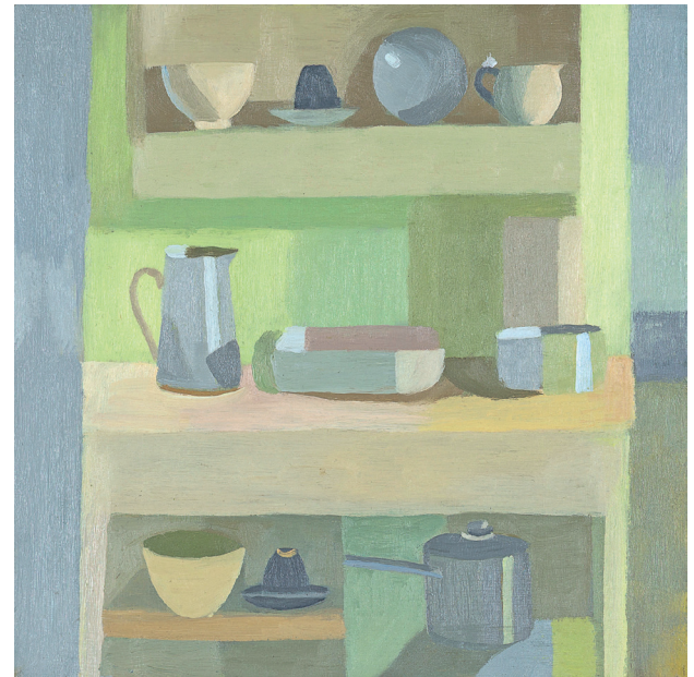
ABOVE My Favourite Things