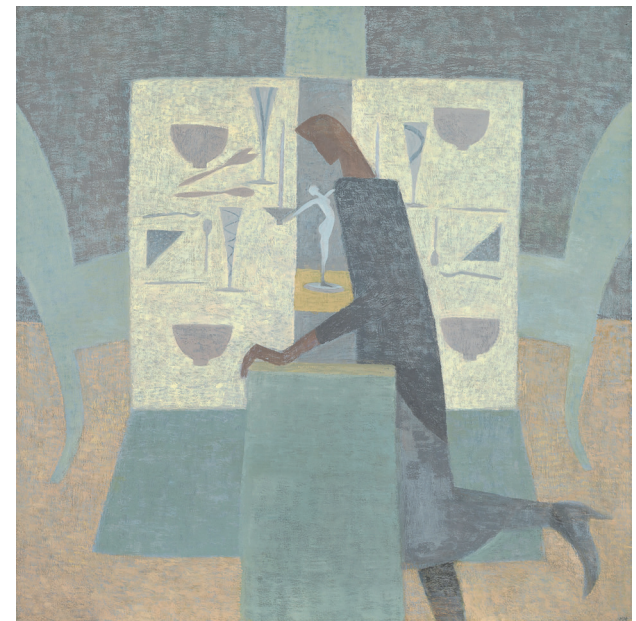
ABOVE Dinner Party III