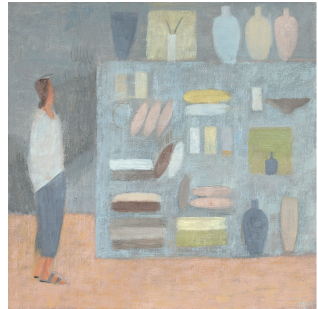
ABOVE Zara Home