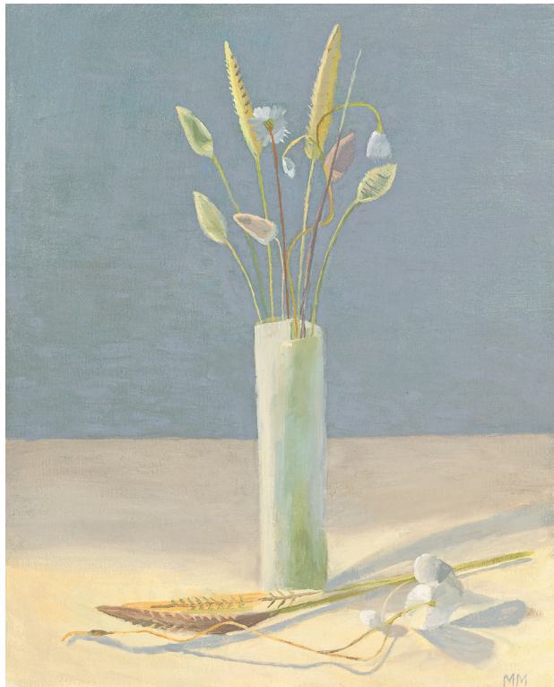
ABOVE Pot with Grasses