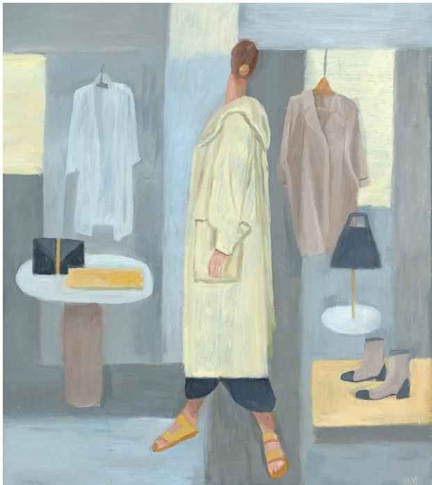
ABOVE Going Shopping